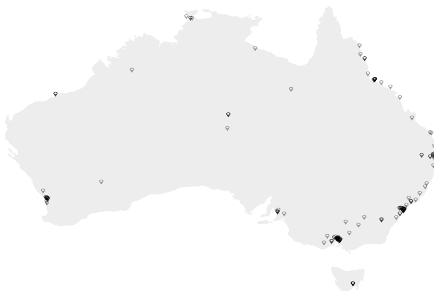
Figure 2 – Australian Incidents by Location

In terms of where this violence has occurred, Figure 2 visualises the location of all 181 incidents. As demonstrated below, far-right violence clusters around major population centres, and has occurred in every capital city across Australia. While Figure 2 does not immediately highlight any specific city or region as particularly problematic, it is worth analysing this information in more detail.